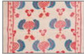
FA101B Naz in Red