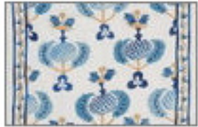
FA101A Naz in Blue